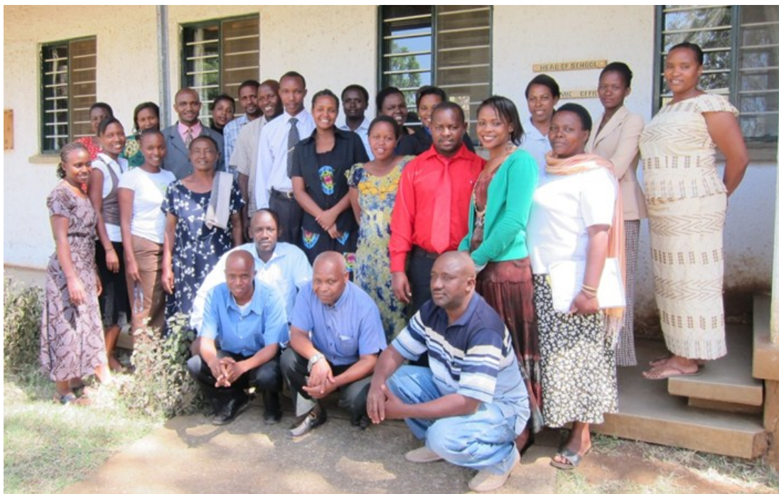
MaaSAE Girls' Lutheran Secondary School Staff

The commitment of sponsors, along with other donors to MGLSS, must be emphasized. Without them, the amazing story of MGLSS could not be written.