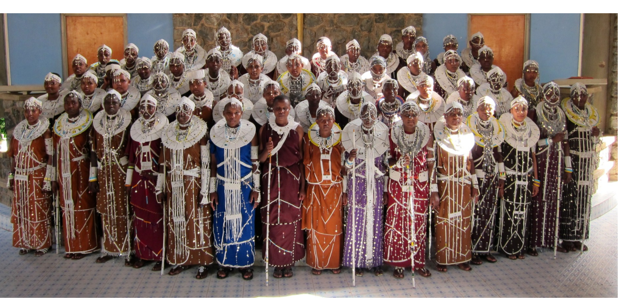
Form IV Graduating Class, September 25, 2011