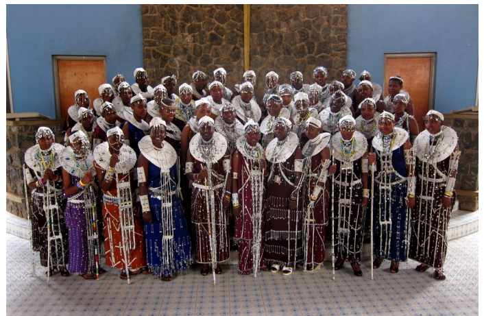
The 17th MGLSS Form 4 class graduated on October 17

As expenses of the school have increased dramatically, especially teacher salaries, it became necessary to supplement OBA support with tuition from paying students. In 2012, the school enrolled the first non-OBA sponsored students and has gradually increased the number each year. The OBA Board of Directors voted in 2015 to slowly decrease the number of sponsored students over the next five years and work with the school to ensure its sustainability. Each year going forward, MGLSS will enroll 25 new OBA sponsored students in Form 1. OBA will continue to provide support for currently enrolled OBA sponsored students until they graduate, as well as support for capital projects, teacher sponsorships, uniforms and textbooks. All qualified OBA sponsored students will remain eligible for post-secondary scholarships.