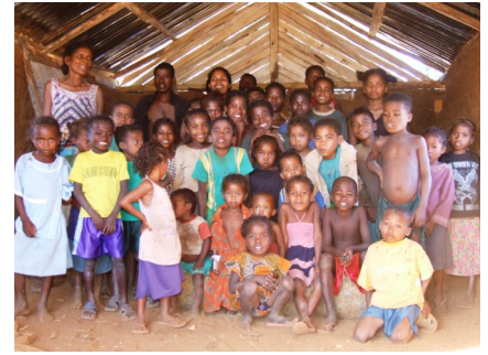
Newly constructed classroom in Andembene, Madagascar

In 1963, OBA was encouraged to extend its educational mission to Madagascar. Schools were built in the remote, southernmost part of the country. Today, working in partnership with the Malagasy Lutheran Church, OBA donors provide salaries for teachers at 5 rural schools in the “Land of Thorns” region of Madagascar.