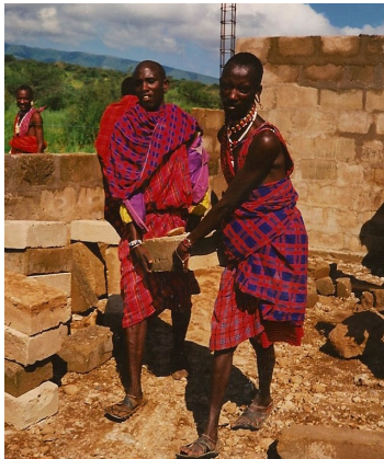
Maasai fathers building a school for their children

The concept was simple and effective. Rural parents were enlisted to build schools for their children, with American partners providing supplies such as metal roofing, nails, and cement. At the time, a classroom could be built for less than $3,000. With Bootstrap support, thousands of classrooms were built by Tanzanian villagers in many parts of the country.