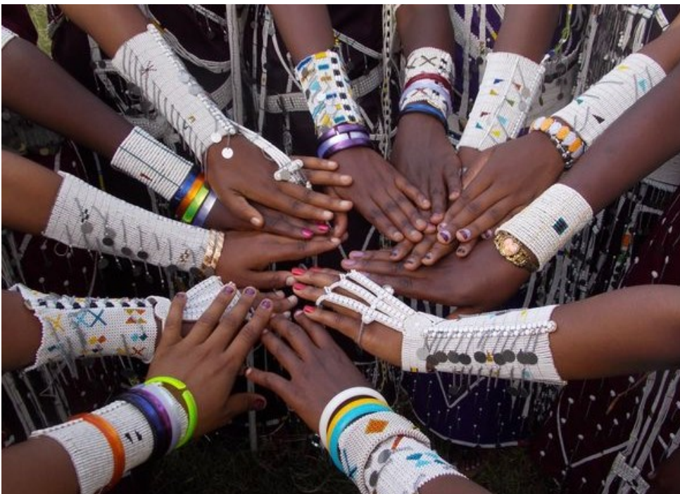
MGLSS Form 6 students join hands in celebration of their graduation.

and medical personnel. The sustainability of our projects is insured by these dedicated partners.