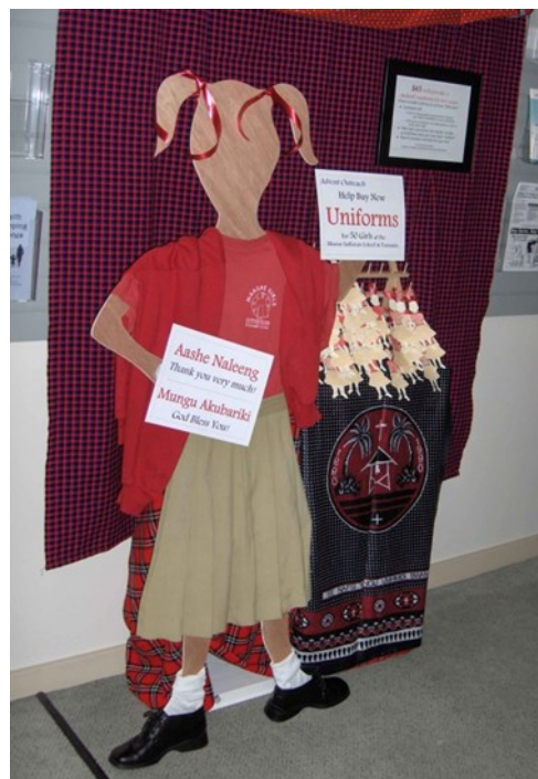
At Christmas, a complete uniform is "sold" to those at St. Andrew's who wish to outfit a new student at MGLSS

St. Andrew's members especially support the work of MGLSS through sponsorships and special projects at the school, including science textbooks and medical care for students. OBA's post-secondary program receives funding from the congregation for several students from MGLSS who are continuing their education.