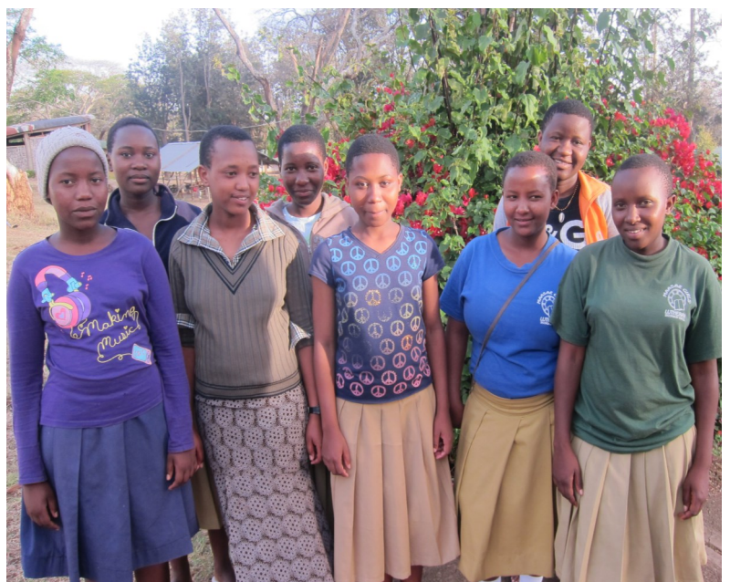
Hadzabe students at the MaaSAE Girls School

“There can be no escape from poverty without a vast expansion of secondary education. . . The inequalities, especially in relation to girls' exclusion from secondary education, have enormous implications, . . . from child and maternal health and HIV prevention to environmental security.” said UNESCO's Director-General Irina Bokova.